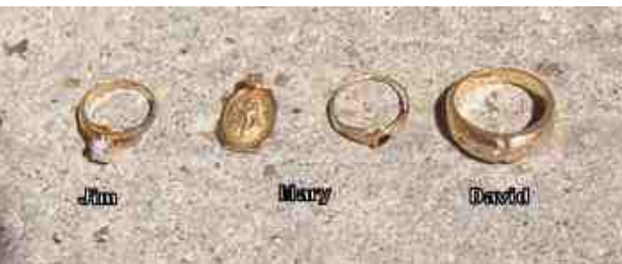
Gold Found During Sunday Morning's Hunt