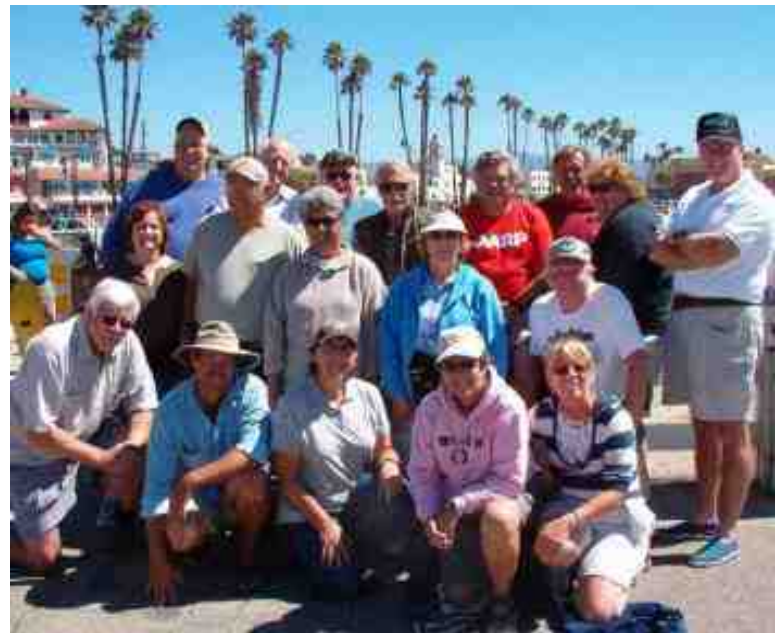
SVDB Beach Hunt Group Picture

The Beach Hunt was a success-take a look at the chart below and you will see that there were five Gold jewelry items found, 1,089 coins for a dollar total of $89.92. This does not include the warm up coin hunt which is recorded separately.