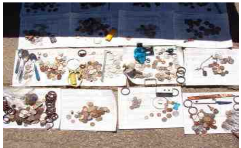
Groups Saturday Morning's Finds