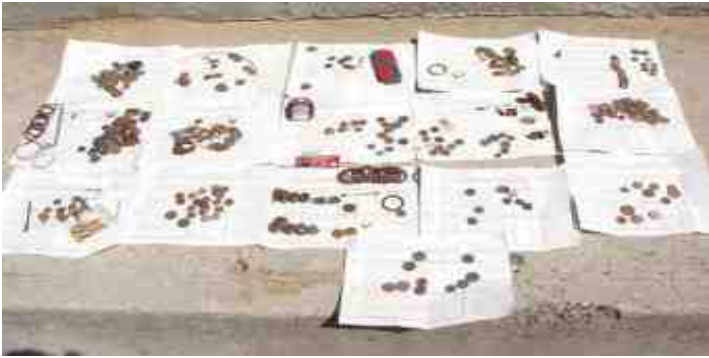
Groups Sunday Morning's Finds