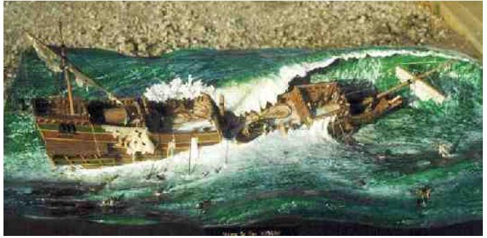
Artist's Rendition of Atocha Sinking