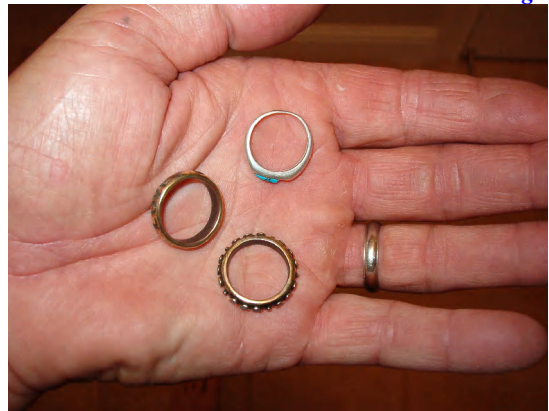
Lee's Silver Ring and Two Brass Hippie Style Rings