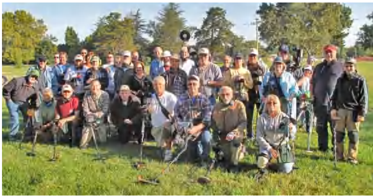
October 10th Johnston Park SVDBers