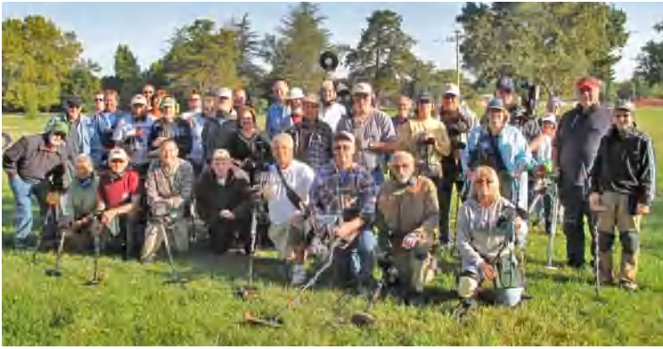
October 10th Johnston Park SVDBers