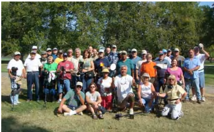
Tahoe Park Hunt on August 6th with 40 SVDBers