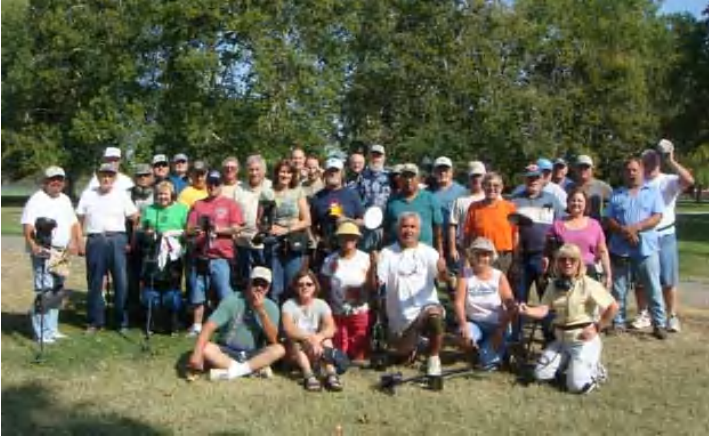
Tahoe Park Hunt on August 6th with 40 SVDBers