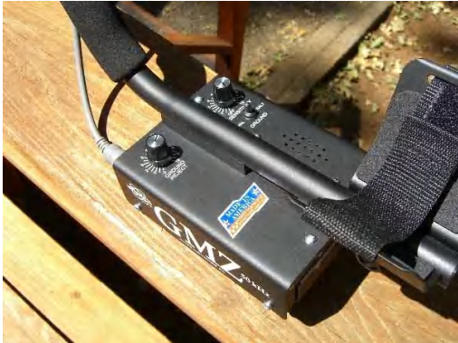
Whites New Gold Detector - the GMZ

4. I've discovered that carrying a hand-held scoop is fine for the beaches but I often go into the water because I use the Fisher 1280 waterproof detector. This requires the long handled scoop for reaching down in deeper water. My point is to use the long handled scoop even on the beach. The idea is to drag the scoop behind you in one hand as you cover the beach. Presto! you have marked exactly where you have gone and can go back and forth on the beach and actually overlap your coverage without missing any areas.