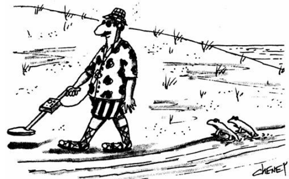
"On second thought...let's not evolve."