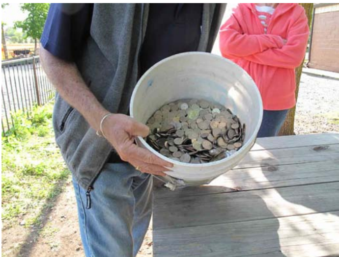
6,000 + Clad Coins Planted at the Annual Hunt