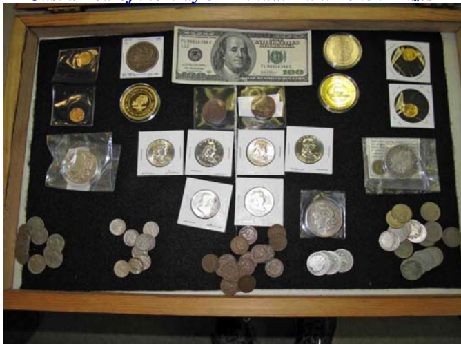
Just a Few of the May 8th Annual Hunt Token Prizes

**See page 5 for everything you wanted to know about the Annual Hunt**