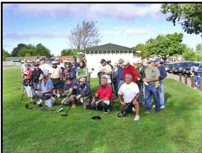
Brock Park Hunt Participants